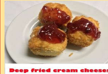
#14. Cream cheese 炸芝士 (3 pcs)