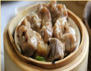
#24. Spareribs 排骨