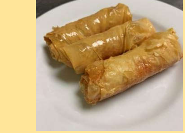
#10. Crispy seafood wraps 海鮮腐皮卷 (3 pcs)