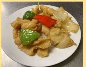
#4. Squids 炸鮮魷