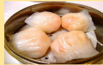
#9. Steamed shrimp dumplings 蝦餃 (4 pcs)