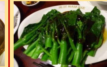
#15. Vegetable oyster sauce 油菜