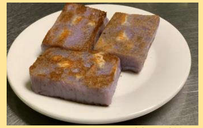
#39. Taro cakes 芋頭糕- 甜 (3 pcs)