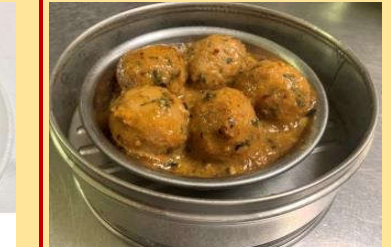
#20. Satay meat balls 沙爹豬肉丸