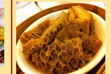
#22. Beef stomach 牛肚