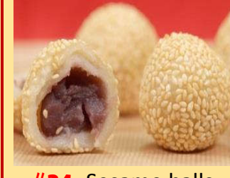
#34. Sesame balls 煎堆仔 (3 pcs)