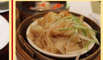
#21. Beef tripe 牛栢葉