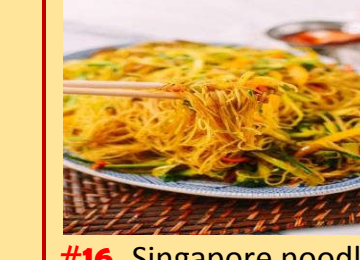
#16. Singapore noodle 星洲炒米