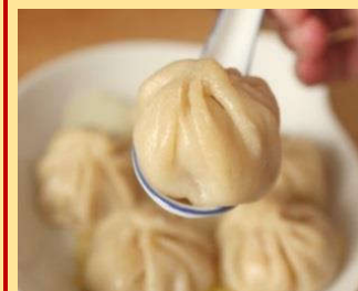
#37. Shanghai dumplings 小籠包 (3 pcs)